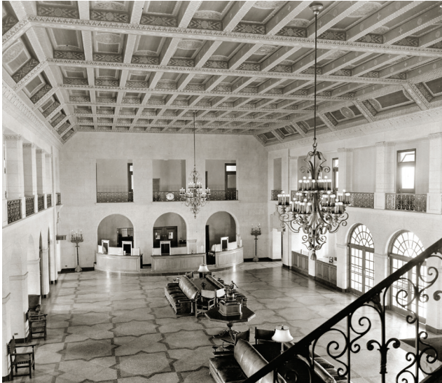
1937 Airport Passenger Lobby

The San Francisco Airport Commission Aviation Library and Louis A. Turpen Aviation Museum opened in December 2000 as part of SFO Museum. Museum visitors and library patrons of all ages can discover and learn about the history of air travel and the role that commercial aviation plays in our everyday lives.