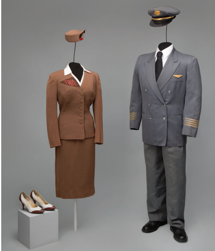
TWA (Trans World Airlines) winter air hostess uniform and insignia c. 1955 Designer: Oleg Cassini; Manufacturer: Briny Marlin wool, cotton, metal, leather SFO Museum; Gift of TWA Clipped Wings International, Inc. 2002.113.005, .028-.032 L2015.2201.026-.032

During the 1950s, commercial aviation was expanding rapidly, and many passengers were flying for the first time. Improved aircraft were needed by the airlines to lower costs, attract new customers, and gain advantages over competitors. The fast, large-capacity Lockheed Constellation, with its unique dolphin-shaped fuselage and distinctive tripartite tail, was the premier long-range airliner of the era. QUEEN of the SKIES presents the legacy of this magnificent airplane through a selection of airline uniforms, models, promotional objects, inflight equipment, and passenger service items.