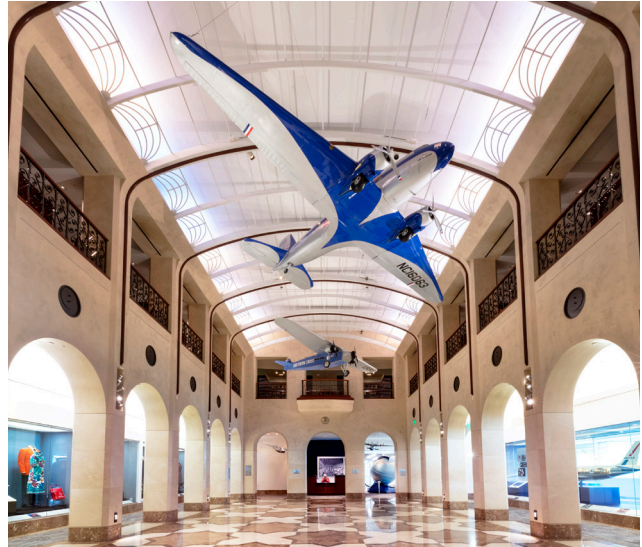
Aviation Museum and Library

The Aviation Museum and Library is housed within an architectural adaptation of San Francisco's original 1937 airport passenger lobby. The permanent collection focuses on the history of commercial aviation with an emphasis on the West Coast and the Pacific region. Museum exhibitions and research services in the library and archives are offered free to the public. Educational programs are held in this unique facility, which is also available for private events. Open daily, 10:00 AM to 4:30 PM , closed holidays. The aviation museum and library is located pre-security and admission is free.